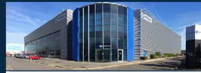
Southampton, UK Production Facility Europe, South Africa, Middle East, Oceania