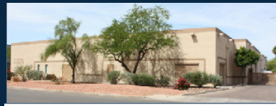
Chandler, AZ, USA FilConn Production Facility Global