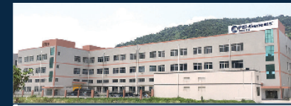
Zhuhai, China Production Facility Asia