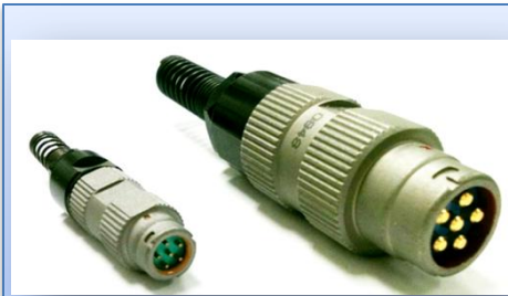
NEW!!! TAC In-Line Receptacle MAJ-56-30 compared to M55116/14