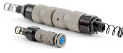
TAC / Standard M55116 size comparison