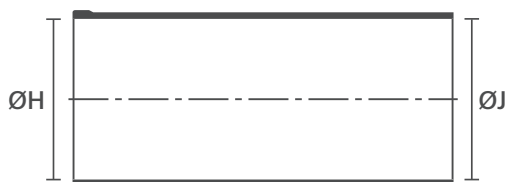
a: Expanded form (supplied)