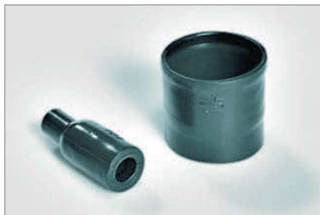
100 series supplied / fully recovered.

For Material / Adhesive selection and other information please refer to page 10.