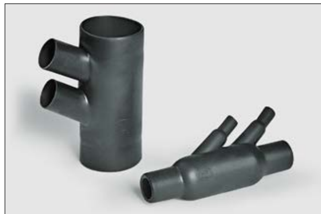
1310-1 supplied / fully recovered.