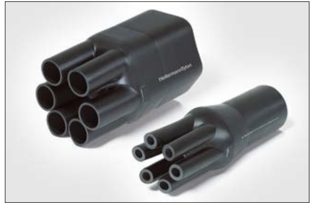
600 Series supplied / fully recovered.