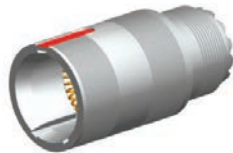
2M804-004-01 In-Line with Rear Accessory Threads