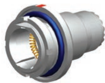
2M804-004-07 Rear Mount Jam Nut with Rear Accessory Threads