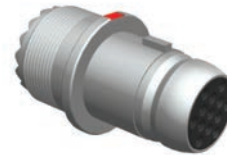
2M804-002-06 Plug with Rear Accessory Thread