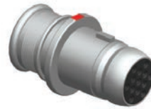
2M804-001-06 Plug with Integral Backshell