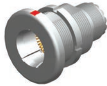
2M804-004-00 Front Mount Jam Nut with Rear Accessory Threads