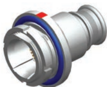
2M804-003-07 Rear Mount Jam Nut with Integral Backshell