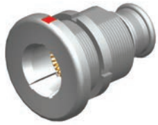
2M804-003-00 Front Mount Jam Nut with Integral Backshell